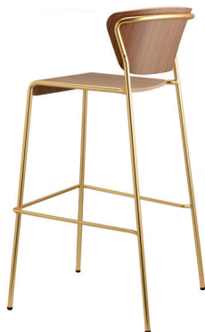
2854 OS NC

Seduta e schienale in multistrato di faggio. Struttura a 4 gambe in acciaio tubolare ø mm 16. Impilabile. Per uso interno.